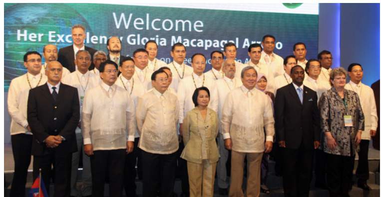
Attendees at the Green Industry in Asia meeting

For more information go to http://www.unido.org/greenindustryconference