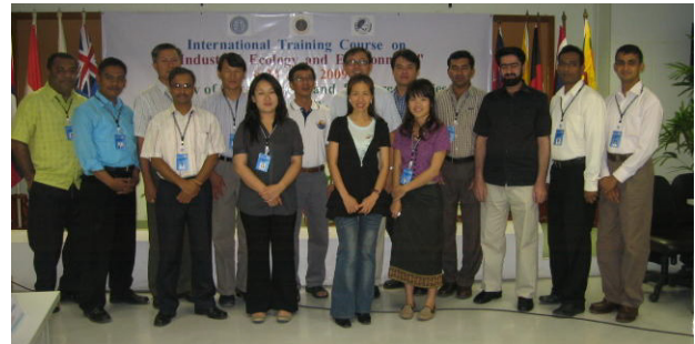
Participants in the Colombo Plan Training Course on Industrial Ecology and Environment

tam Company Limited and PTT Chemical Public Company Limited in Rayong, Recycle Engineering Company Limited in Chonburi, and Siam City Cement in Rajburi. The main purpose of the field trip was to give participants examples of the industrial ecology concepts being applied in real situations so that participants might apply the concepts in their countries.